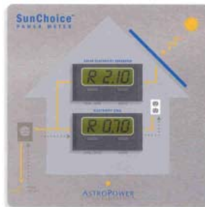
The PV system meter displays solar electricity generated and electricity used in the home.

Each "Premier ProEnergy" home is designed with cutting edge energy technologies that will be independently inspected for quality and performance. Using ComfortWise construction protocols and features, each home qualifies for the Environmental Protection Agency (EPA) and the Department of Energy's (DOE) ENERGY STAR® Homes national program. Specific energy-efficiency features include: a 2 kW AC solar electric home power system, a tankless water heater that produces 6.5 gallons of hot water per minute, a mechanically designed heating and air conditioning system, spectrally selective glass windows, and tightly sealed air ducts.