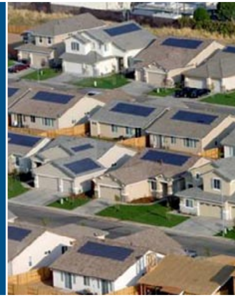
A view of the 95 homes of Premier Gardens, all today's zero energy.